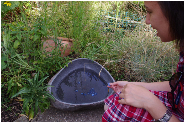
Prayer Station 4 – Dropping a pebble in the bowl