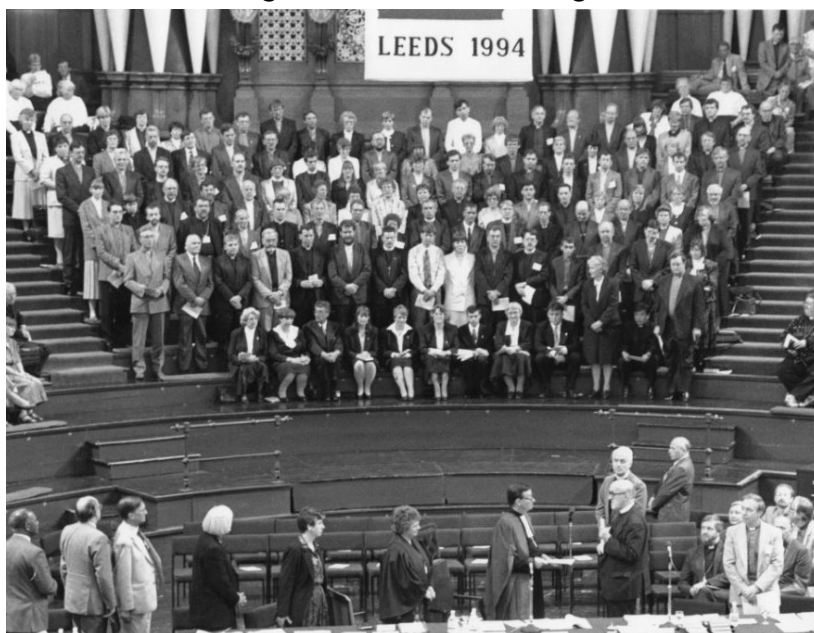
Ordination, Leeds 1994