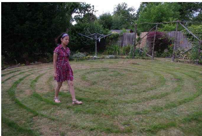
Prayer Station 3 – Walking the Labyrinth

At the fourth station, we were invited to sit awhile, reflecting on those things in our lives that burden us and weigh us down. Then, we were invited to offer them to God by dropping a glass pebble into a stone bowl.