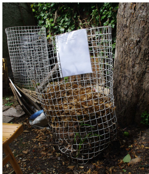
Prayer Station 2 The barren places in our lives

The third station was the labyrinth. Walking a labyrinth is an ancient practice. When the great cathedrals were built in the middle ages, a labyrinth would be built into the floor of the nave and, on entering the cathedral pilgrims would follow the lines of the labyrinth as an act of devotion, sometimes on their knees. In following its lines in the grass to the centre, we were invited to prepare ourselves to pray, to offload the pressures of the day, and then, following the lines back out to invite God's presence into our daily lives.