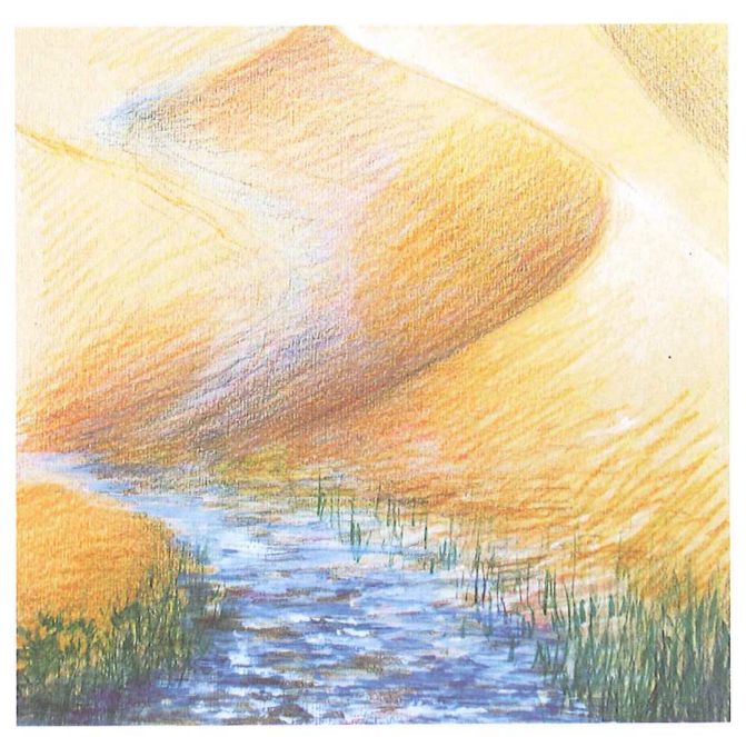
Praying for Egypt

Friday 7th March Women's World Day of Prayer All are welcome