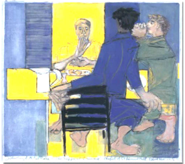
The Supper at Emmaus Ceri Richards