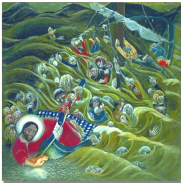
Storm Over the Lake Eularia Clarke

There is a core team for the exhibition, but could you spend two hours for one afternoon simply attending and keeping the doors open? The aim is to have the exhibit open at least 4 afternoons and one evening per week (in addition to scheduled group visits) for drop-in visitors.