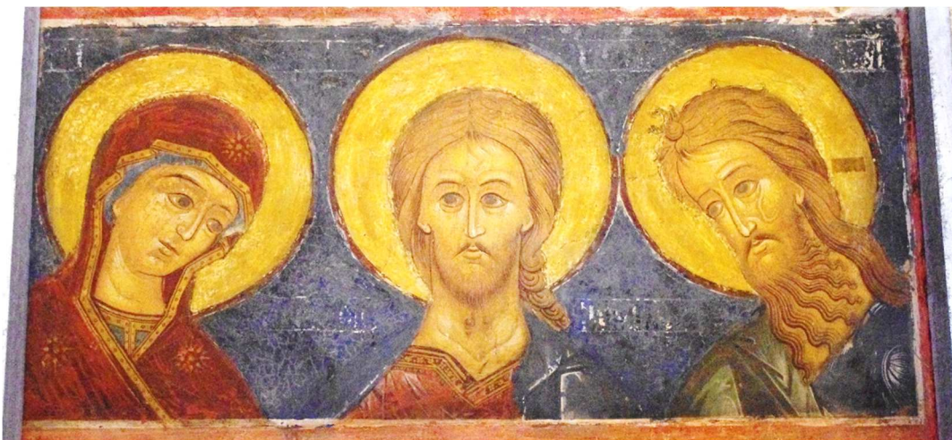
Fresco of the Virgin Mary, Christ and John the Baptist in the Cathedral of the Nativity of the Virgin, Suzdal, Russia

Love for enemies Luke Ch 6 vv 27-36 Matthew Ch 5 vv 43-48 Teaching about revenge Matthew Ch 5 vv 38-42 Jesus preaches in the synagogue Luke Ch 4 vv 16-end