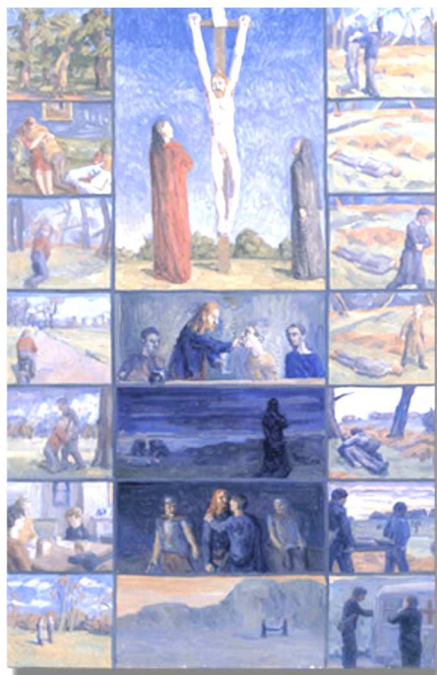
Crucifixion Polyptych Francis Hoyland