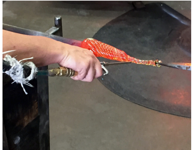
Glassblowing in New Mexico

I also created art as well as looking at it - in New Mexico as well as in the UK I went to glassblowing workshops and watched the molten glass dance and change as it was heated, cooled and blown. At home I enjoy creating flat glass objects and bowls formed from flat sheets shaped over a mould in a glass kiln. Sabbatical gave me a chance to work with molten glass taken from a furnace crucible. This meant that I could shape paperweights, baubles etc, feeling and watching the glass change as it heated and cooled.