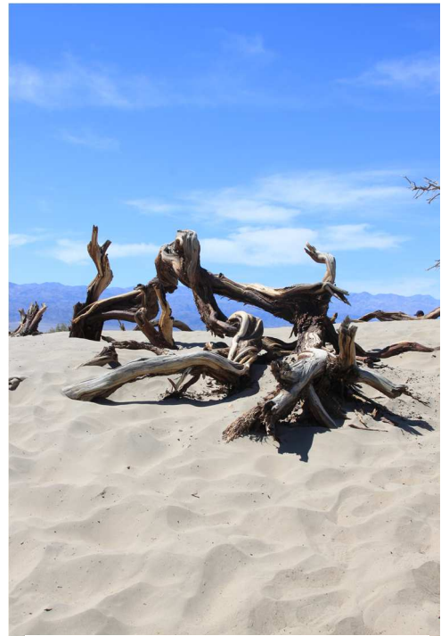
'A proper desert'

We'd had several days of driving, walking, photographing and wondering at the desert. We'd seen amazing variety and huge stretches of unchanged landscape. These had been filled with stunning plants flowering in the desert spring. Then we got to Death Valley and what Thomas termed 'proper desert' - a place that conformed to our expectations of sand dunes devoid of vegetation, of searing heat and dry air. In fact, even here, as we got closer we could see the small scrubby bushes that had found a foothold in the unpromising looking sand dunes and the skeletons of trees that had once grown to full height.